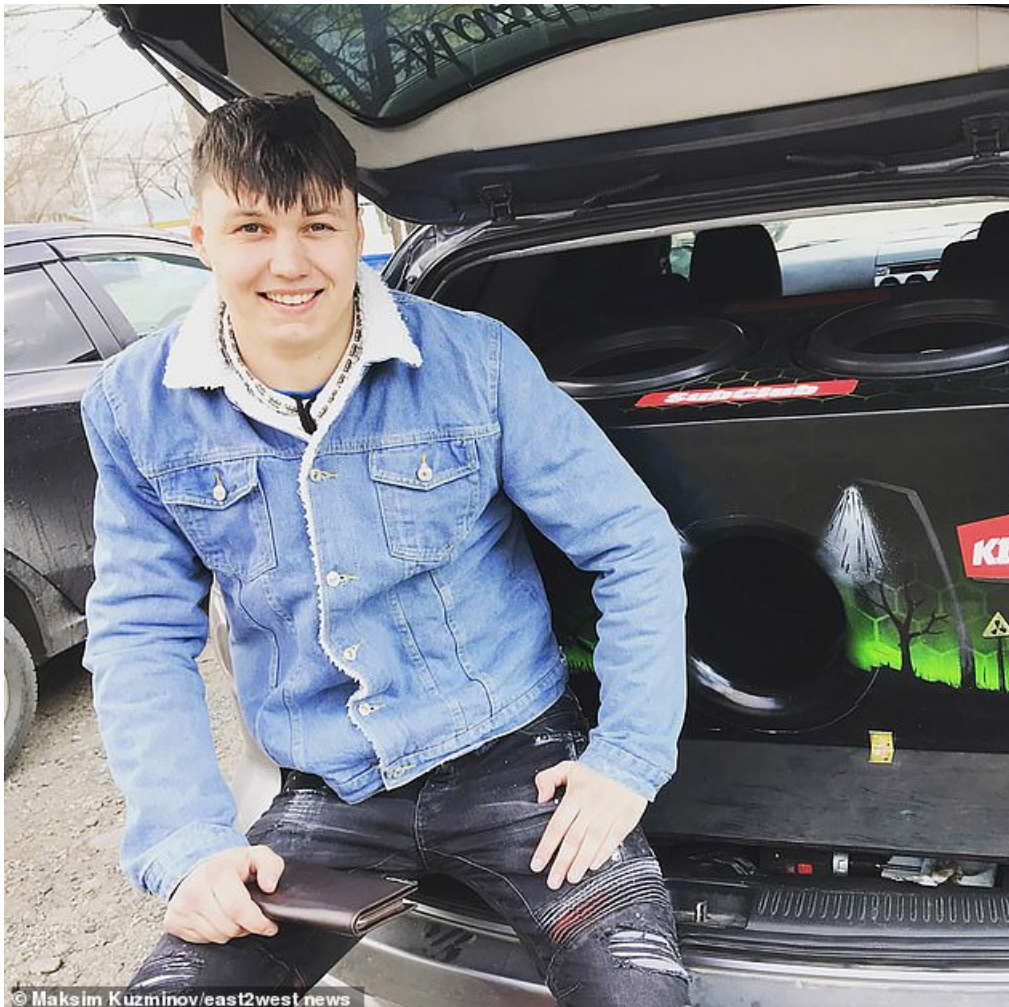
Maksim Kuzminov, died at 29, shot multiple times and run over by his own car in Spain 13 February, 2024

Knox Church values the support of all who are involved in our community's life. Knox Church is a charity. All charitable donations are eligible for a tax rebate of 33%. Bank account - 03 1705 0029641 00. Put your name in the reference field and email your contact details to the office. For further information or options contact: office@knoxchurch.co.nz ph: 379 2456.